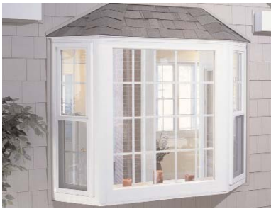
Roof finished with asphalt shingles

Top your bay or bow window off with a custom roof system from Harvey. Systems are supplied as a one-piece unit ready for installation. Choose from genuine copper, painted aluminum or structural roofs that are ready to be finished with asphalt or wood shingles. Painted aluminum color options include Coppertone, Patina, Bronze and White.