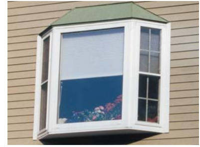
Painted aluminum roof maintains its original color