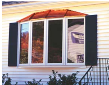
Genuine copper roof seasons to a soft green patina color